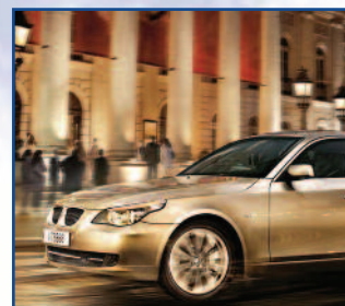
BMW 5 Series (E53) / OmniArmor Test Sample