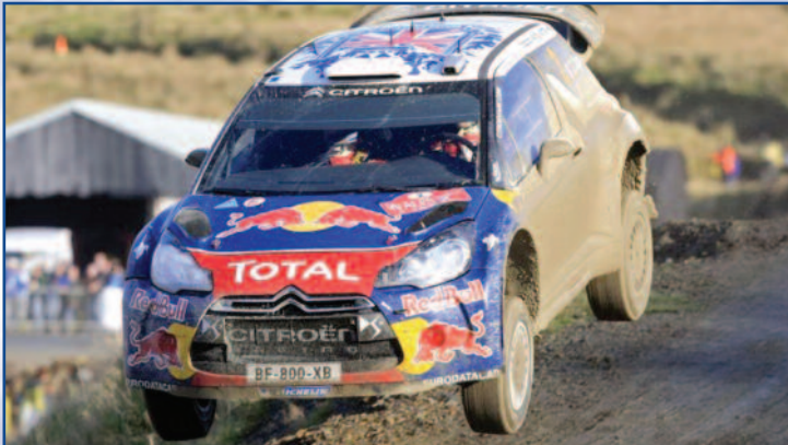
Citroën Sport DS3

Where the championship dictates that the glazings must be road legal Isoclima has developed many ECE-43 R compositions, from 2.66mm to 5.96mm thickness, with special chemically strengthened glass plies, for various vehicles across the entire range of FIA approved GT and WRC competitions.