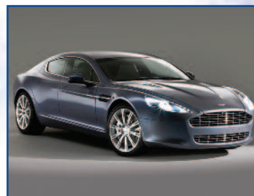
Aston Martin Lagonda Rapide

Based on a capacity to undertake small volume design and development, Isoclima is the chosen supplier of many of the world's leading car manufacturers and styling houses who require the production of high quality, leading edge innovative design using Glass and Polycarbonate glazings for their show case vehicles.