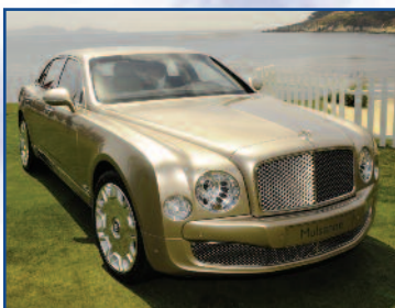
Bentley Motors Mulsanne