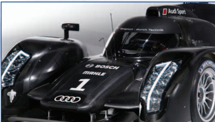
Audi Motorsport R18 Le Mans

The technology used in the manufacture of these lightweight glazings is derived from producing composite windshields for military aircraft. This has enabled the forming of complex shapes whilst retaining an excellent optical quality.